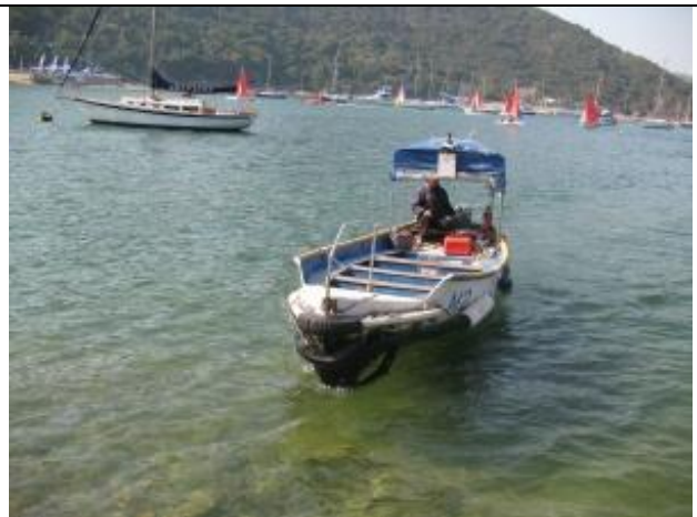
(11) until one of our ferries spots you and comes to pick you up to take you on the 2 minute journey across to Middle Island. 我們其中一艘舢板將看見你並會接載你到中途島，船程只消 2 分鐘。