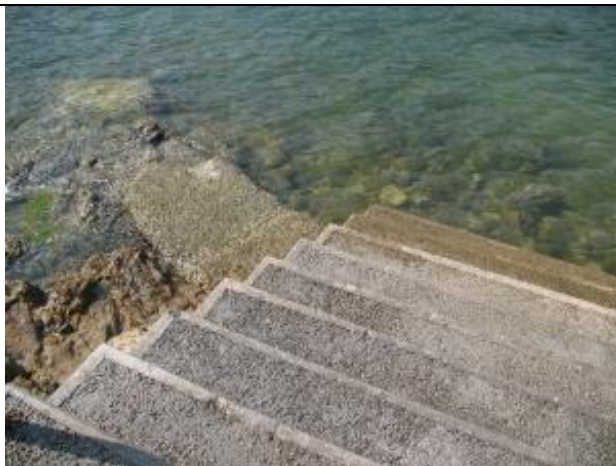
(10) Move further down the pier and it won't be long... 向前走不遠處...