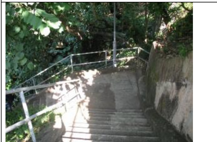
(5) There are a lot of stairs. 梯級無數！