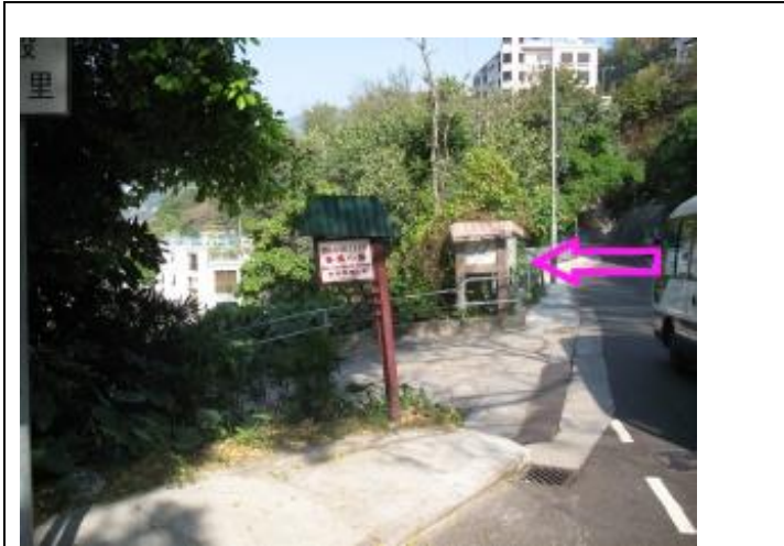
(1) 50 and 52 Island Road are situated at the top of Island Road (overlooking the water) just before it meets Repulse Bay Road. On the right hand side of the driveway shown in this photo, you will find a staircase doing down. 香島道 50 至 52 號位於此路之前段(面向海方面)，與淺水灣道接連處相近。如此圖所示，在車路之左面(在香島小築隔鄰)可見有樓梯通往下方。

Arriving via stairs (not recommended for the elderly or for those with young children/strollers etc. – see alternative directions to arrive via Seaview Promenade.) 取道由樓梯往中途島(由於路途崎嶇不平，不建議年長人士、幼兒及使用嬰兒車者使用，請參考另一途徑由麗海堤岸路前往)