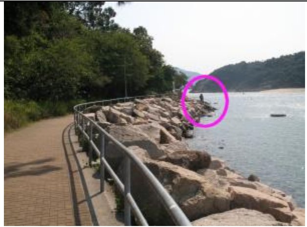
(7) Continue walking. You are aiming to find a little pier jutting into the water (as shown above). 繼續走便可見一個小碼頭由岸邊伸出(如圖示)。