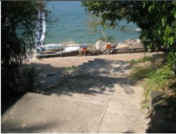
(7) Until you reach the water. 直至見到海灘