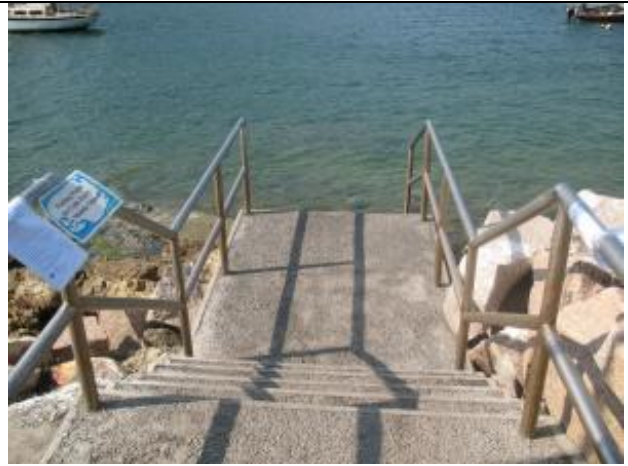
(8) As soon as you reach the bottom of the stairs you will find yourself on the Seaview Promenade and in front of you, you will see a little pier jutting into the water. 當你到達樓梯之盡頭，你就處於麗海堤岸路上，你可以見到一個小碼頭由岸邊伸出。