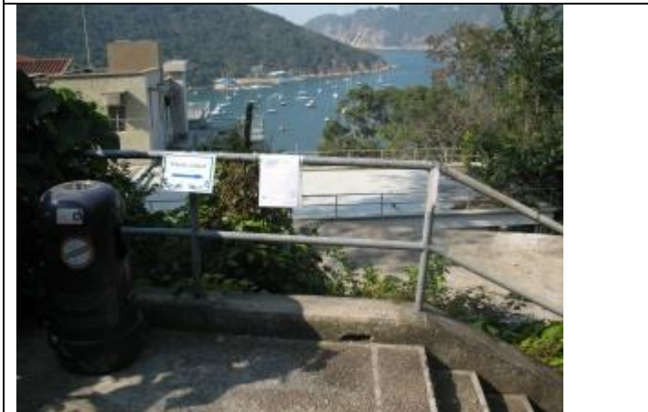
(3) a closeup of the entrance 樓梯入口之大特寫