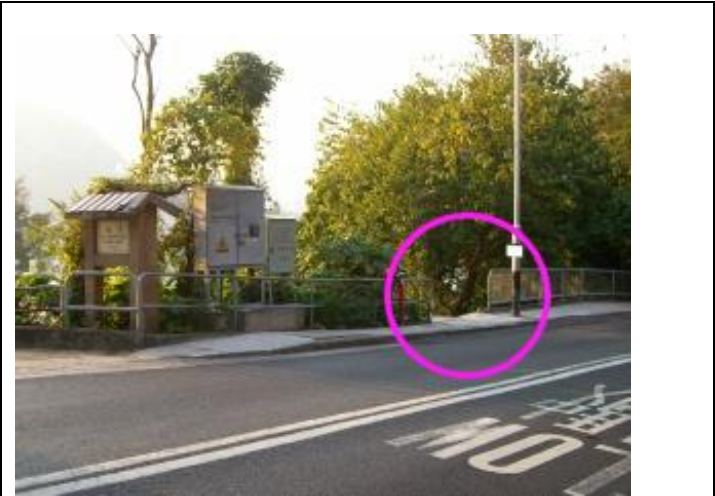
(2) Here is the entrance to the staircase. 此處是樓梯的入口(在香島小築的右面)。