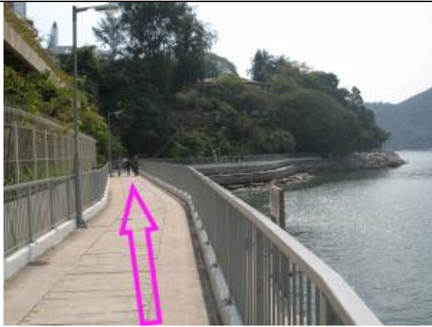
(6) Keep going along following the Seaview Promenade which goes along the shoreline. 繼續沿著位於岸邊的麗海堤岸路往前走。