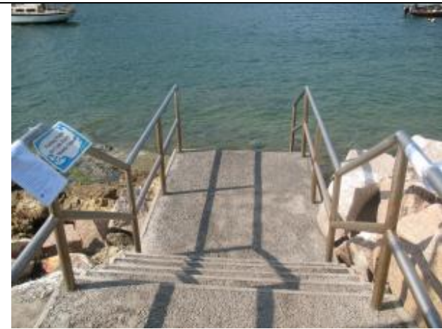
(9) This is the little pier jutting into the water. 這裏便是小碼頭。