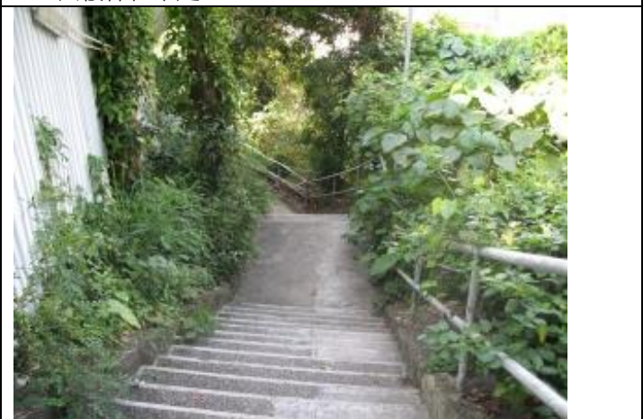
(6) Keep going all the way down... 繼續拾級而下...