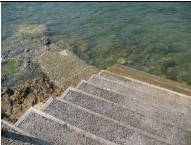
(9) Move further down the pier and it won't be long... 繼續向前走不遠處...