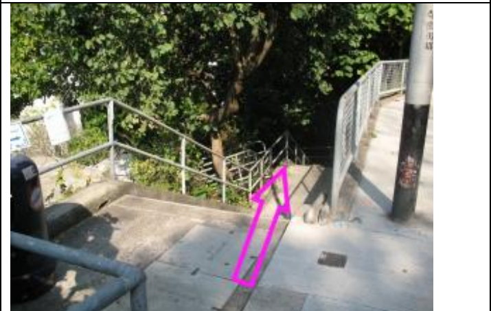
(4) start going down the stairs 由樓梯往下走