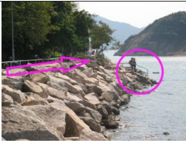
(8) After you have walked about 10 minutes from Deep Water Bay you will get to the ferry pier. 徒步由深水灣至碼頭約 10 分鐘路程。